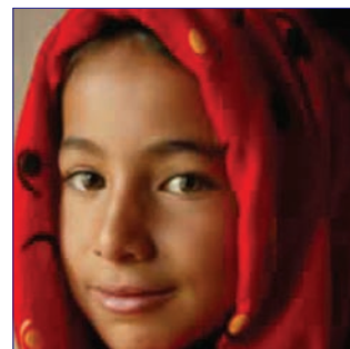
LOTTIE MOON CHRISTMAS OFFERING Sunday, December 14