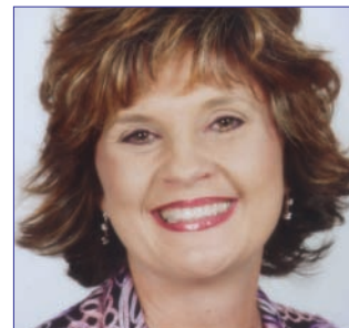
LADIES' NIGHT OUT February 2, 2009 – 6:30 p.m.

An incredible musical celebration of Christmas featuring internationally renowned, professional piano duo “Nielson & Young” and our own 125-voice choir and orchestra.